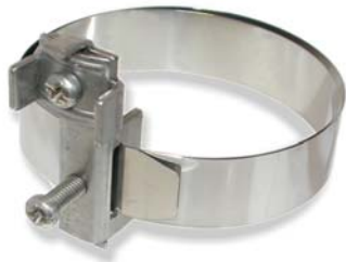
Strip earthing clip

All-purpose earthing clip with 16 mm 2 grounding conductor for all connector sizes from 1/2" to 1-5/8".